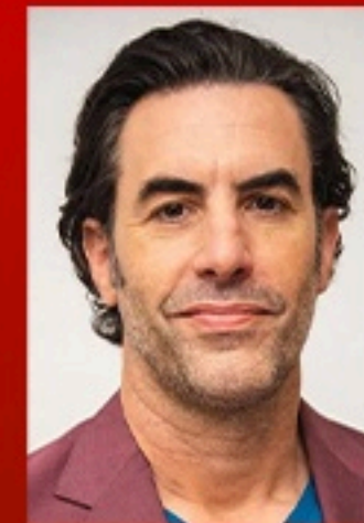
SACHA BARON COHEN