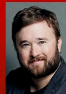
HALEY JOEL OSMENT